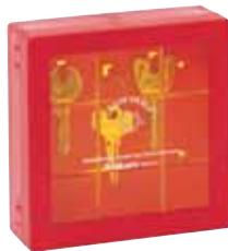
Red painted ABS box for keys.