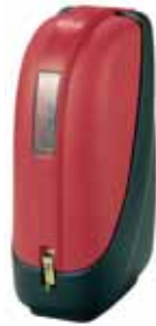
Plastic Box for 6 Kgs. fire extinguisher for truck.