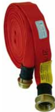
Flexible fire hose EN 9487.