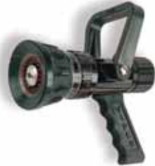
Nozzle UNI 45.