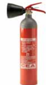
Portable fire extinguisher 2 Kgs carbon dioxide base Fire class 34B C € 1115 H2ES