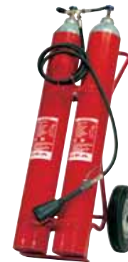
Wheeled fire extinguisher 54 Kgs. carbon dioxide base Fire class B6-C C € 1115 H54