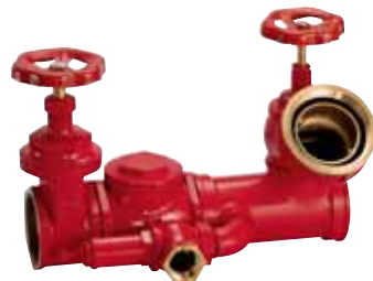
Hydrant connection for fire brigade truck pump.