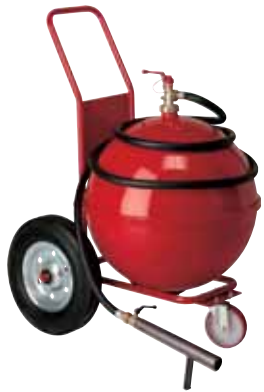
Wheeled fire extinguisher 100 Kgs. of ABC powder Fire class A-B1-C C € 1115 PS100