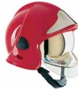
Helmet F1 in compliance with norm EN 443.