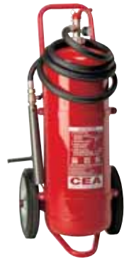
Wheeled fire extinguisher 30 Kgs. of ABC powder Fire class A-B1-C C € 1115 PD30