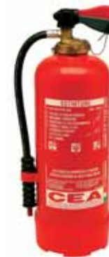
Portable fire extinguisher 12 Kgs. of ABC powder with internal bottle Fire class 55A-233B-C C € 1115 PBI2MQ