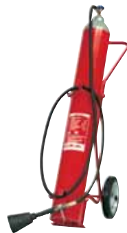
Wheeled fire extinguisher 27 Kgs. carbon dioxide base Fire class B10-C C € 1115 H27