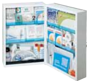
First aid box.