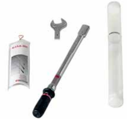
Dynamometric key for correct valve installation.