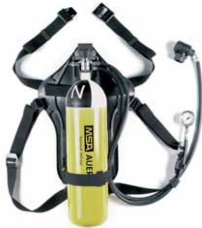
Self-contained breathing apparatus.