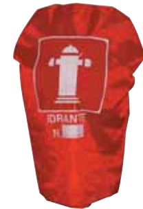
Waterproof plastic blanket for fire hydrant.