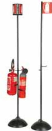
Fire extinguisher supporting column.