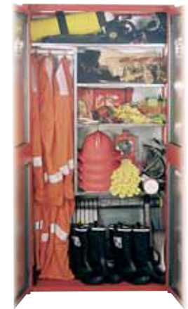
Empty cabinet for fire-fighting accessories.