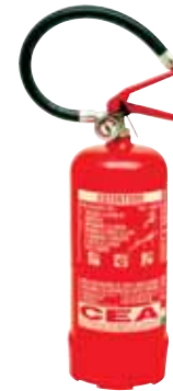
Portable fire extinguisher 6 Kgs. of ABC powder Fire class 34A-233B-C C € 0036 PD6ES