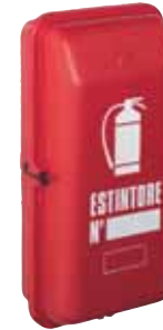
Indoor red painted ABS box for fire extinguisher.