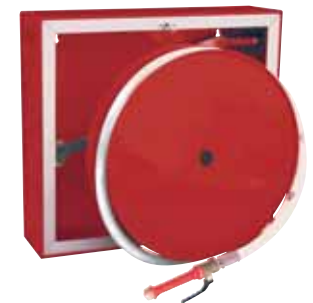
Fire hose reel in cabinet in compliance with norm UNI EN 671-1 wall mounting with semi-rigid tube.