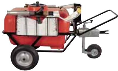
Mobile trailer for fire fighting foams.