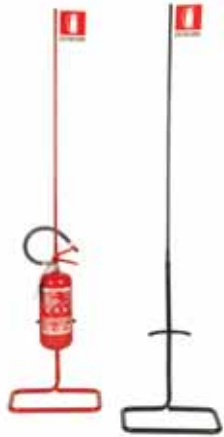
Fire extinguisher supporting column.