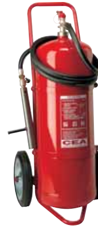
Wheeled fire extinguisher 50 Kgs. of ABC powder Fire class A-B1-C C € 1115 PD50