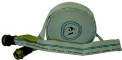
Flexible fire hose UNI EN 14540.