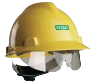
Helmet V Gard in compliance with norm EN 397.