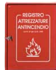
Red painted ABS box for documents.