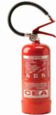
Portable fire extinguisher 6 Kgs. of ABC powder Fire class 55A-233B-C C € 0036 PD6MQ