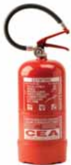
Portable fire extinguisher 9 Kgs. of ABC powder Fire class 55A-233B-C C € 0036 PD9ES