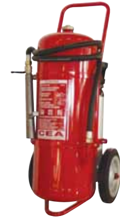
Wheeled fire extinguisher with external bottle 50 Kgs. of ABC powder Fire class A-B1-C C € 1115 PD50BE