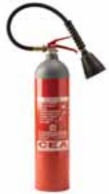
Portable fire extinguisher 5 Kgs carbon dioxide base Fire class 113B C € 1115 H5ES