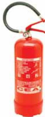
Portable fire extinguisher 12 Kgs. of ABC powder Fire class 55A-233B-C C € 0036 PD12MQ