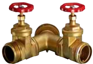
Divider with 2 outlets.